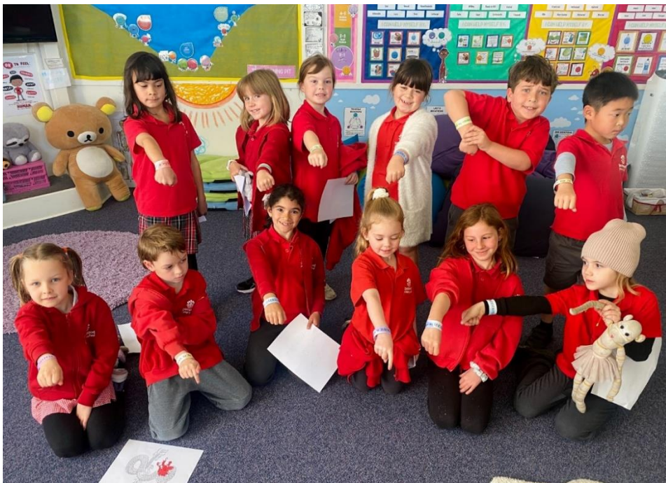
Year 1/2B wearing paper bracelets with growth mindset affirmations :)

In Wellbeing students have been learning about Growth Mindset and what it takes to build one. They are learning that our brains can 'grow' when we make mistakes and keep persisting with tasks. They thought about what 'courage' meant to them and shared some new things they have tried lately to help grow their brain.