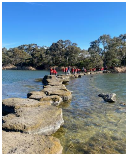
Tianne Ball 1/2B Classroom Teacher