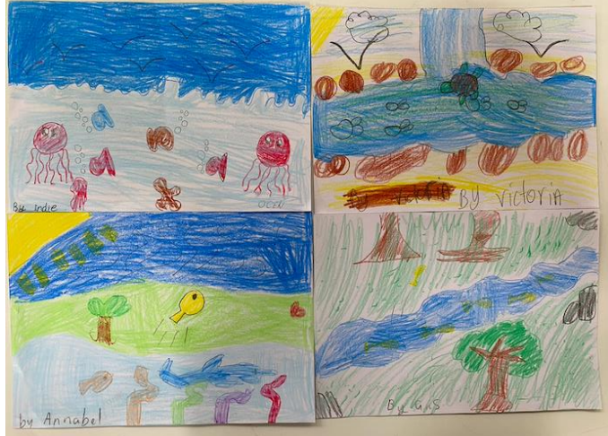
Tianne Ball 1/2B Classroom Teacher